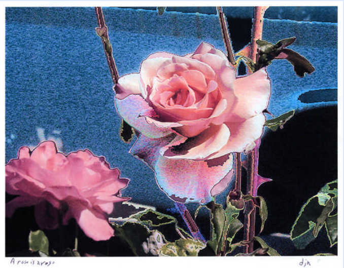
A Rose is a Rose

Friday, March 13, 2009: Caregiver Resources - Speaker to be announced