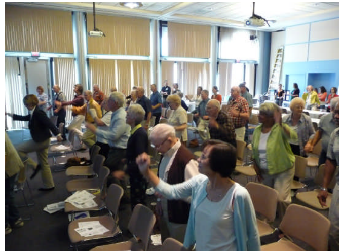
Patients exercising at the Portland VA Medical Center